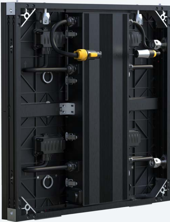
OUTDOOR SMALL PIXEL PITCH LED DISPLAY

In addition to the standard 500*500mm cabinet dimensions, bespoke projects can be facilitated to deliver truly inspirational LED displays and installations.